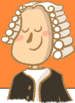
Johann Sebastian Bach