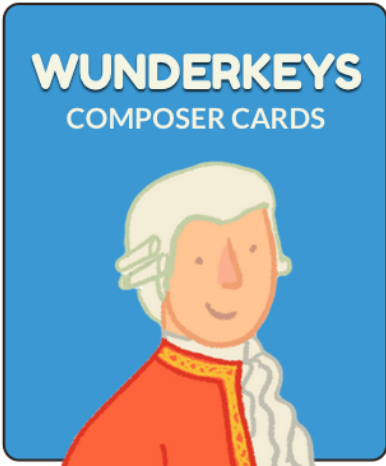
Wolfgang Amadeus Mozart