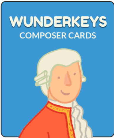
Wolfgang Amadeus Mozart