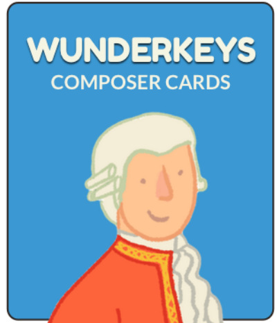
Wolfgang Amadeus Mozart