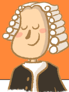
Johann Sebastian Bach