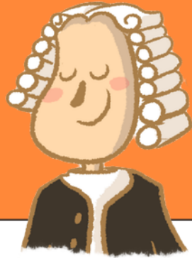
Johann Sebastian Bach