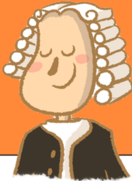
Johann Sebastian Bach