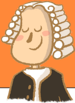
Johann Sebastian Bach