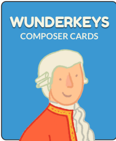
Wolfgang Amadeus Mozart