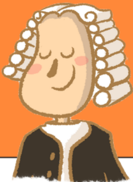
Johann Sebastian Bach