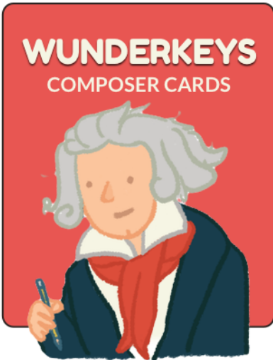
Ludwig van Beethoven