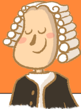
Johann Sebastian Bach